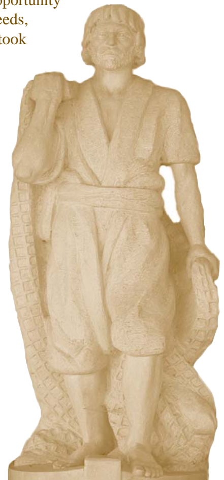
St. Andrew Statue, Rock Falls

Congratulations Monsignor, Parish Leadership Team and the very generous members of St. Andrew Parish. †